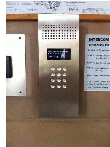
Tiara @ Great World City