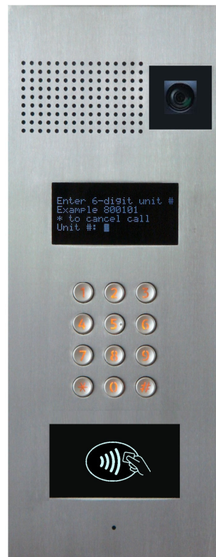
Audio-Video Visitor Call Panel