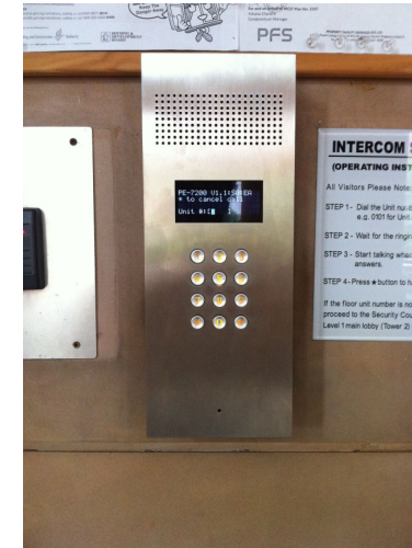
Tiara @ Great World City