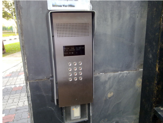
Golden Heights @ Serangoon