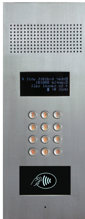
Audio Visitor Call Panel