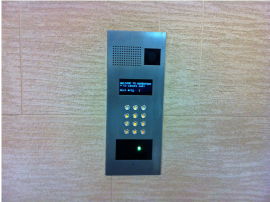
W Residences @ Sentosa Cove